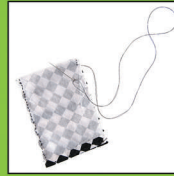
Sew other edge.