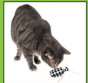
Cat Play time.

Warning: This DIY set contains a sewing kit. Keep out of the reach of children and pets to prevent injuries from sharp objects included in the kit.