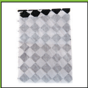
Fold with inside showing.