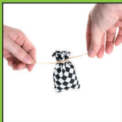
Tie hemp rope at top of blessing bag.