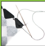
Sew top edge.