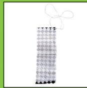
Fold other edge.