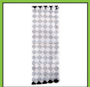
Sew other edge.