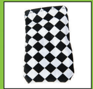
Fold right side out.