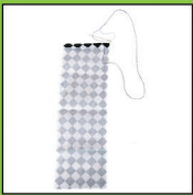
Fold top edge.