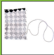
Sew one edge.